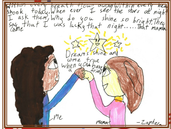
← Zaphera (9)