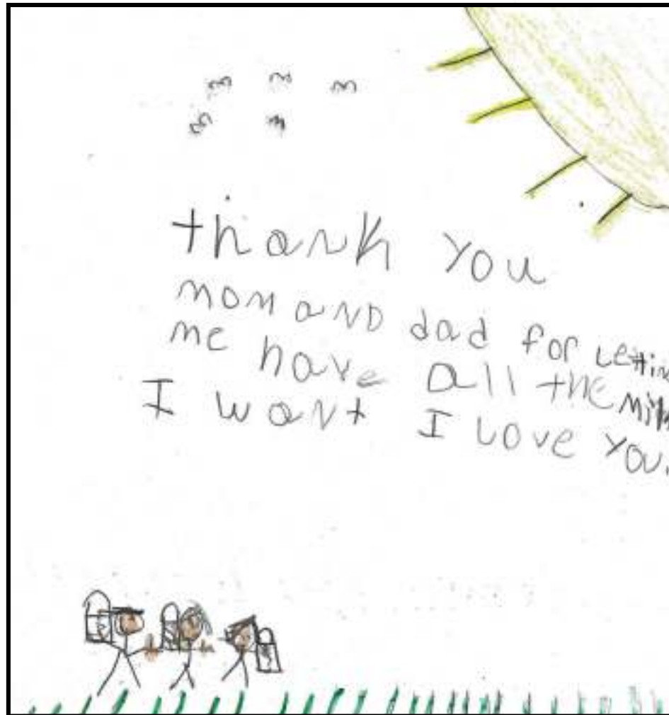
Chevi Age 8