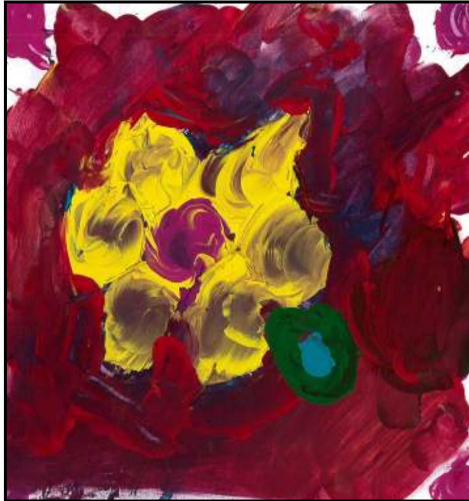
Alyssa Age 10