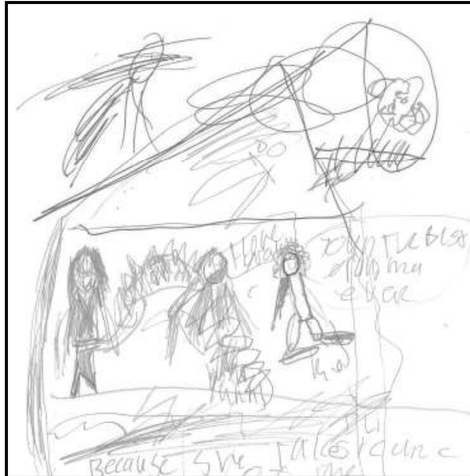
Hayden Age 14