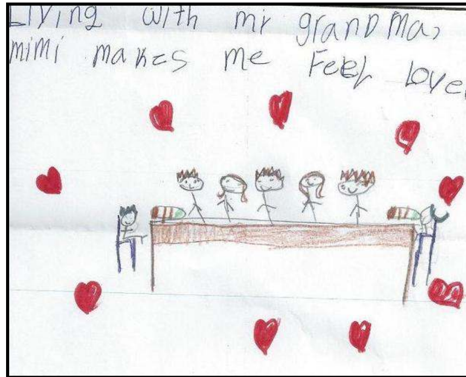
Tessa Age 8, 2013