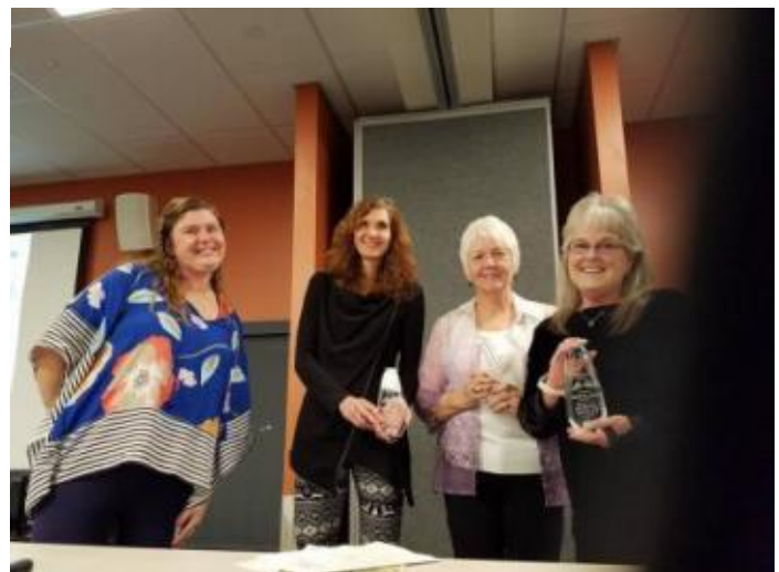
Angel Awards Winners